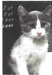
Crackers and Coco were adopted in October.