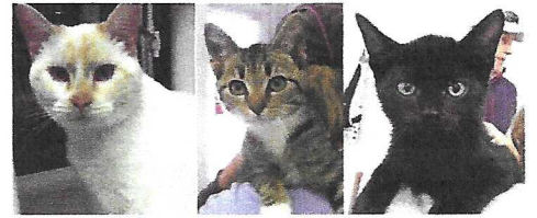
Gus, Ariel and Chia were adopted in January.