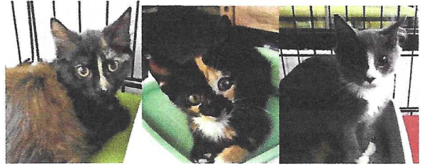
Jasmine, Irene and Little Bear found homes in September.