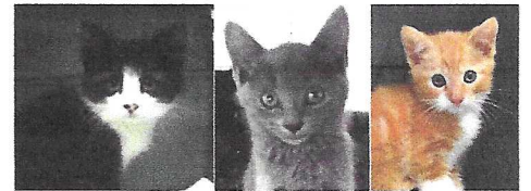
Yoyo, Saucy and Pesto were adopted in June.