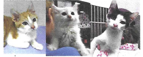
In November, Mac, Angel and Fig found their homes.