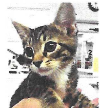
Pepper and Bristol found homes in December.