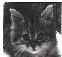
Marigold and Kermit were adopted in November.