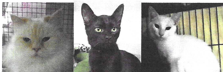
Samantha, Lindy and Arkansas found their new homes in March.

Jerry, Cora and Tessa left in September.