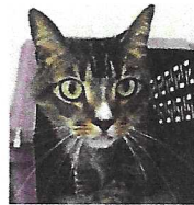
Lucy and Abbott found new homes in May.