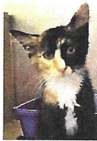
Sugar and Paula were adopted in August.