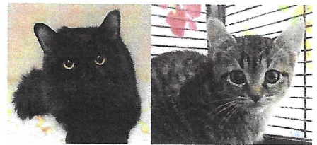
Joey and Fiona were adopted in February.