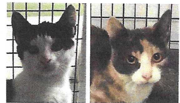
Millie and Polo were adopted in December.