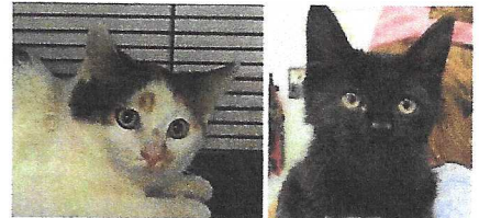
In April, Halle and Cyrus found their homes.