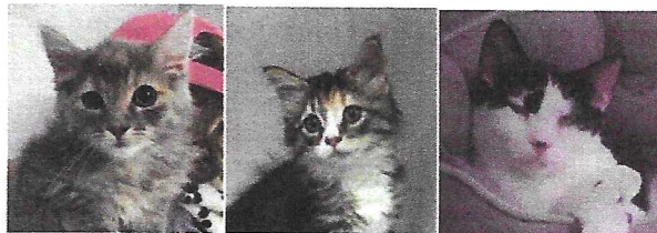
Betty, Natalie and Winks were adopted in January.

Cat Tails has been going to Petsmart in Wilmington on New Centre Drive, near Target, for 16 years. We set up tables along the windows of the grooming center and fill them with colorful beds and hammocks, lots of toys and playful cute kittens. We usually don't take many adult cats to Petsmart because they get too scared. Right now we're using the in-store adoption center because of Covid restrictions. We do our adoptions there on Fridays from 6 to 9 and Saturdays from 9 to 3. Our facility is open on Wednesdays from 11 to 1 and Saturdays and Sundays from 11 to 3.