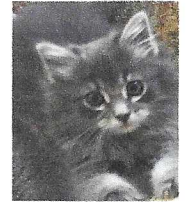
Tweeter & Topaz left in November.