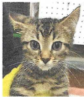
Hudson and Smooch found homes in December.