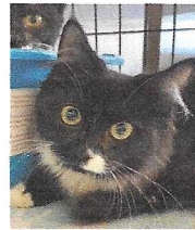
Honey and Jesse found new homes in March.