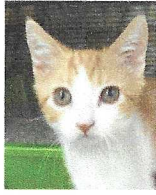
Shadow and Pixie were adopted in October.