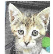
Widget and Hallie were adopted in September.