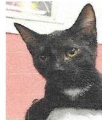
Freya and Nala were adopted in February.