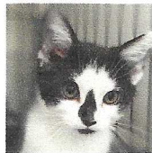
Boomer left in June

This is a rather unusual looking cat isn't it? Well, we would like you to