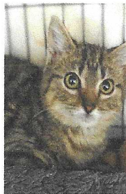
Jolly and Kerry: adopted in January.