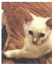
Pepper and Figaro left in May.