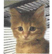
April was good for Muffin & Lady.